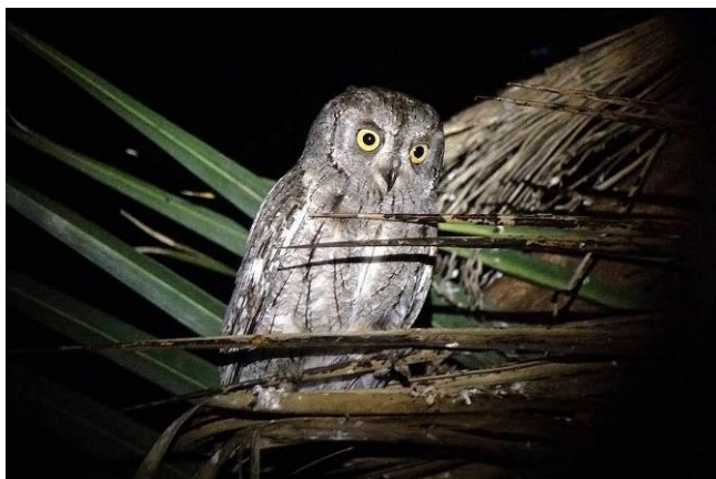
Scops Owl