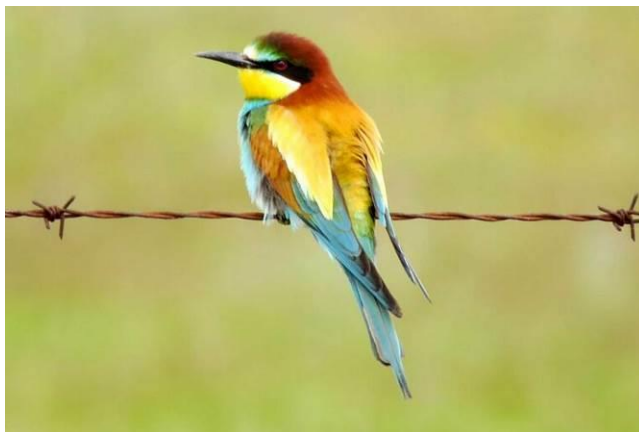
European Bee-eater