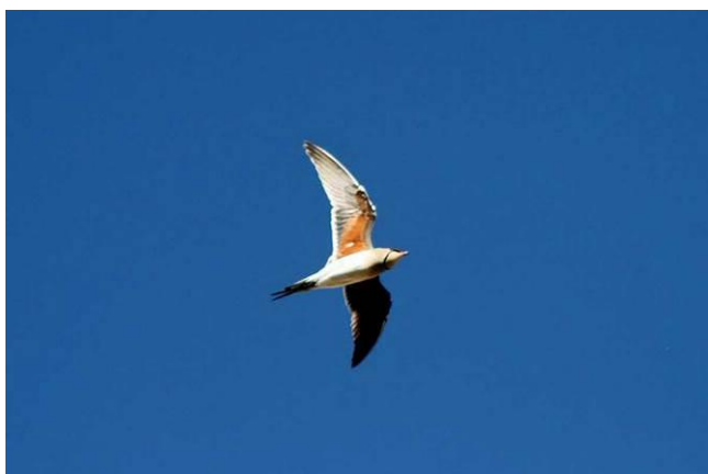
Collared Pratincole by Greg Mabbett