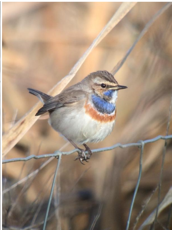
Eurasian Hoopoe and Bluethroat, Madrigalejo 13 th January

After coffee and some of Belen's delights for morning snack, we continued on to the village of Madrigalejo and then to neighbouring Vegas Altas. Common Cranes were all along the route, and Red Avadavat flocks taunted us with their incredibly skittish behaviour – eventually, with patience, we had some decent views. A single Common Greenshank was seen on one of the floods and a superb male Hen Harrier flew up from the ground and ghosted among a party of Cranes before heading off over the fields. We wound our way back towards the main road, seeing a couple more Eurasian Hoopoes, another Bluethroat, Sardinian Warbler, Southern Grey Shrike and Spotless Starlings, and from here we headed to our lunch stop to the north at Alcollarin. Our route took us across a lovely area of steppe near Campo Lugar, and while we didn't see any bustards or sandgrouse in the area, we did get very lucky as an impromptu stop for a roadside Common Kingfisher along a small stream led to the discovery of six Stone Curlews in a field! We jumped out and scoped the birds – also noting a migrating flock of White Storks over the ridge beyond – our third such flock of the trip and a sign that spring is around the corner here already!