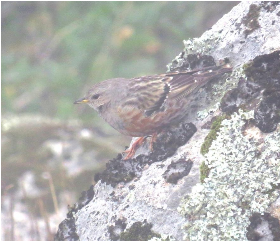
Alpine Accentor, Montanchez

Alpine Accentors each year. We arrived into low cloud shrouding the whole town and our hearts sank a little – it was basically like birding in dense fog and meant visibility was only a few metres at best. Still a super male Blue Rock Thrush and showy Sardinian Warbler on the way up to the Castillo gave us hope, and a Eurasian Hoopoe flicked out from below the castle walls. Over the next hour and a half, we walked up and down the ruins, watching down as best we could onto the rocky slope below. It was cold and very windy, and the fog made life extremely difficult – not a pleasant experience really! We heard an Alpine Accentor call and saw two birds fly over a wall and down the slope, but for an hour we didn't see them again. We were just at the point of giving up when one popped up right in front of us! In the murk, this superb little bird was amazingly easy to lose against the mossy rocks, but with patience everyone had a very good view. Coffee and cake was taken in celebration and for warmth in equal measure!