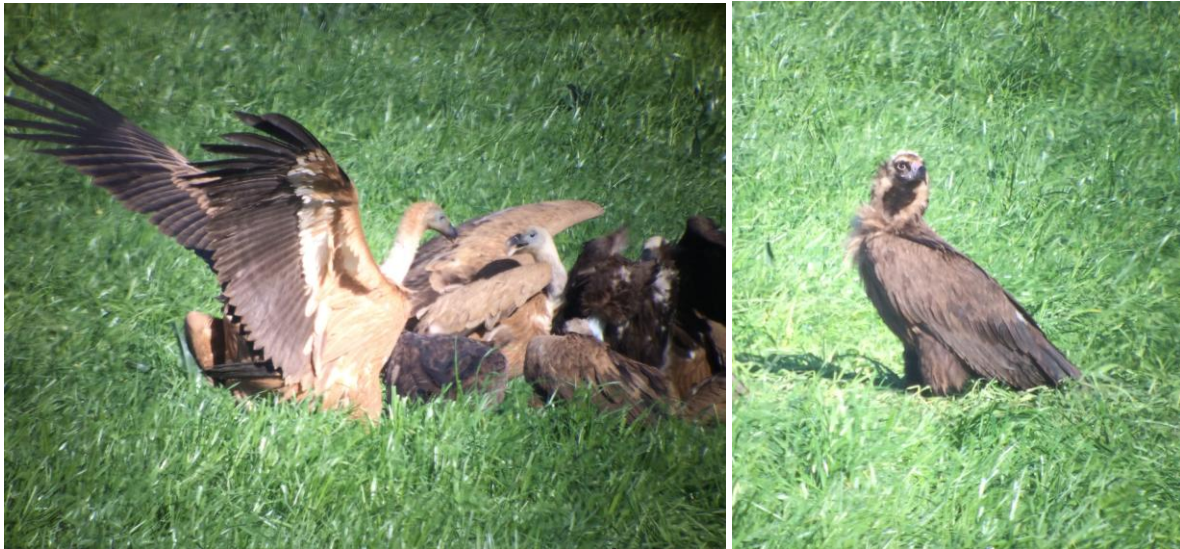
Griffon and Black Vultures, Santa Marta road 12 th January

Blue Tits, Sardinian Warbler, Song Thrush and a single Hawfinch. North of the town of Torrejon, the road winds down across the Arroyo de la Vid and then to the edge of Monfrague National Park – here we took the track up to the Castillo and took a walk up the steps to the fantastic viewpoint at the top. Here Griffon Vultures numbered hundreds and many were passing us at eye level or even down below us – always a great experience. A Blue Rock Thrush was briefly on the castle keep, and the wooded slopes below held another Hawfinch, Black Redstart, Blackcap and other common species. A male Sardinian Warbler was noteworthy for the excellent views it gave, and a Short-toed Treecreeper was singing and showing well just by the parking area as we arrived back at the vehicles.