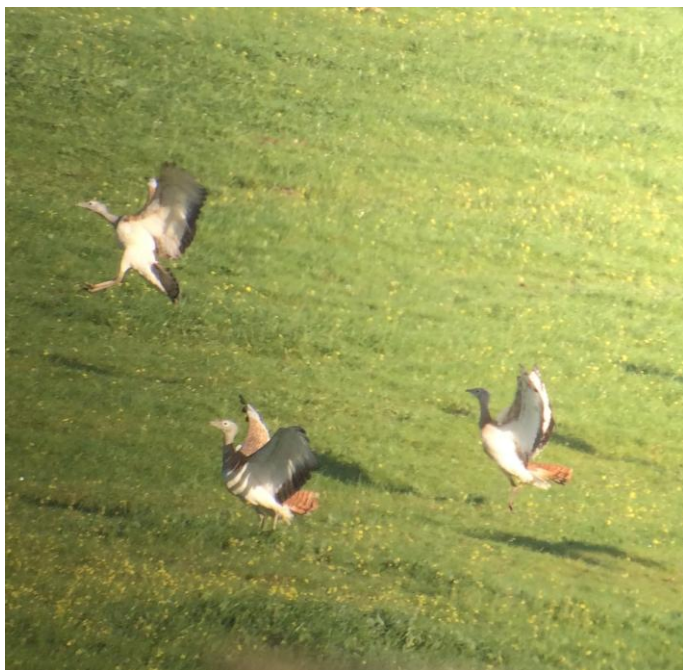
Dartford Warbler and Great Bustards, Santa Marta de Magasca 12 th January

Back at the road we continued towards Santa Marta de Magasca, spotting four Eurasian Griffon and two Black Vultures circling low by the road as we passed. Slowing down to view them, we realised there was a carcass in a field close by and a congregation of vultures were feeding there! The birds were really close to the road, and not bothered by us at all, coming and going, squabbling and feeding as we watched from no more than 150m distant. To compare the two species on the ground at such close range was a new experience for all of us. Approaching the village of Santa Marta, another impromptu stop produced superb views of singing male European Serin, two Woodlark and a pair of Crag Martins which were swooping low over the houses. Time was already wearing away though, and as we reached the crossing of the Rio Almonte just before Monroy, we decided to stop for lunch. We didn't see too much here other than more Griffon Vultures passing over, a few Common Chiffchaffs and a European Robin, but we did enjoy the warm sunshine and a Clouded Yellow butterfly!