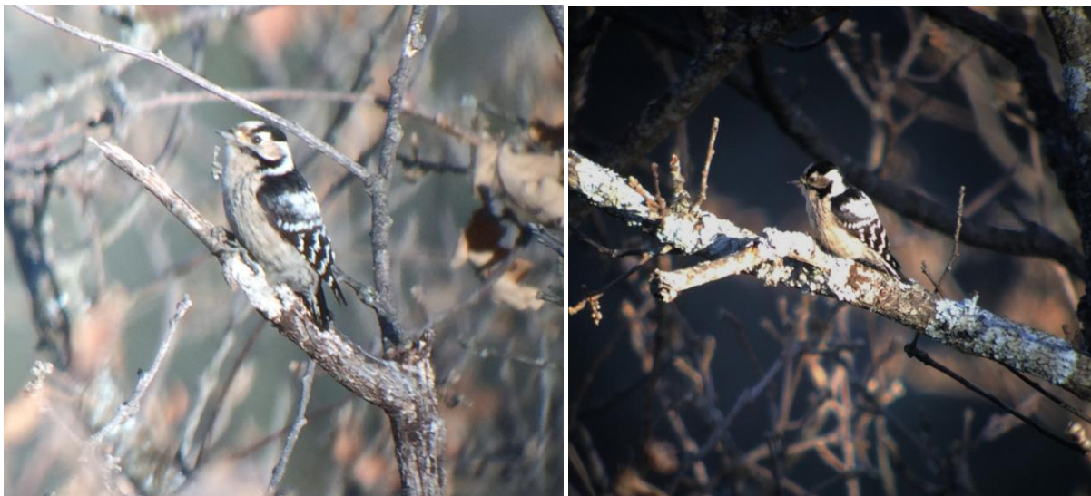
Lesser Spotted Woodpecker, Sierra las Villeucas 13 th January

THURSDAY 14 TH JANUARY – Low cloud and rain, 10C