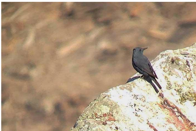
Blue Rock Thrush