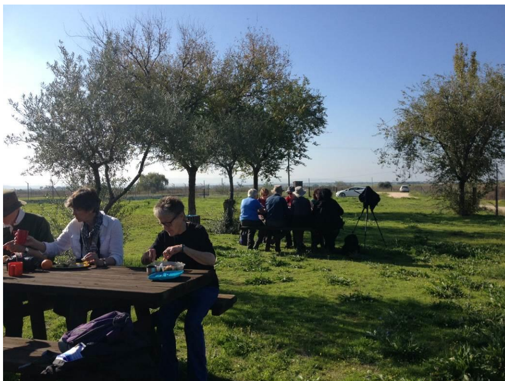
Picnic in Arrocampo

Setting up a personal profile at www.facebook.com is quick, free and easy. The Naturetrek Facebook page is now live; do please pay us a visit!