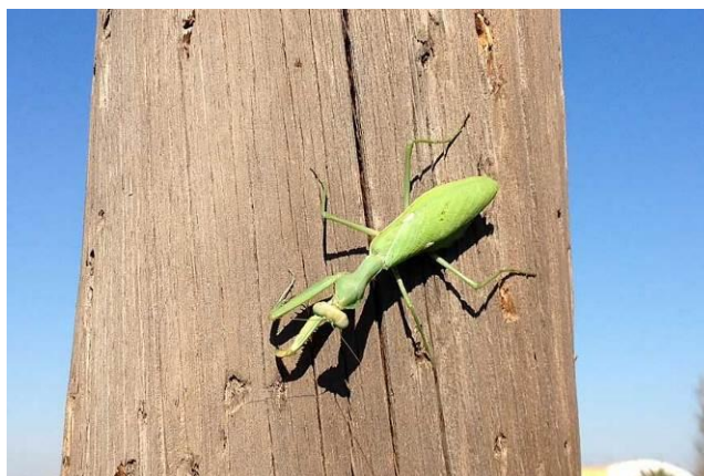
Mantis in Madrigalejo