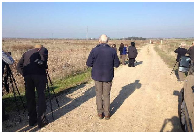
Group in Serrejon looking Black winged kite