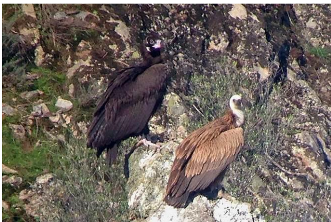
Cinereous & Griffon Vultures